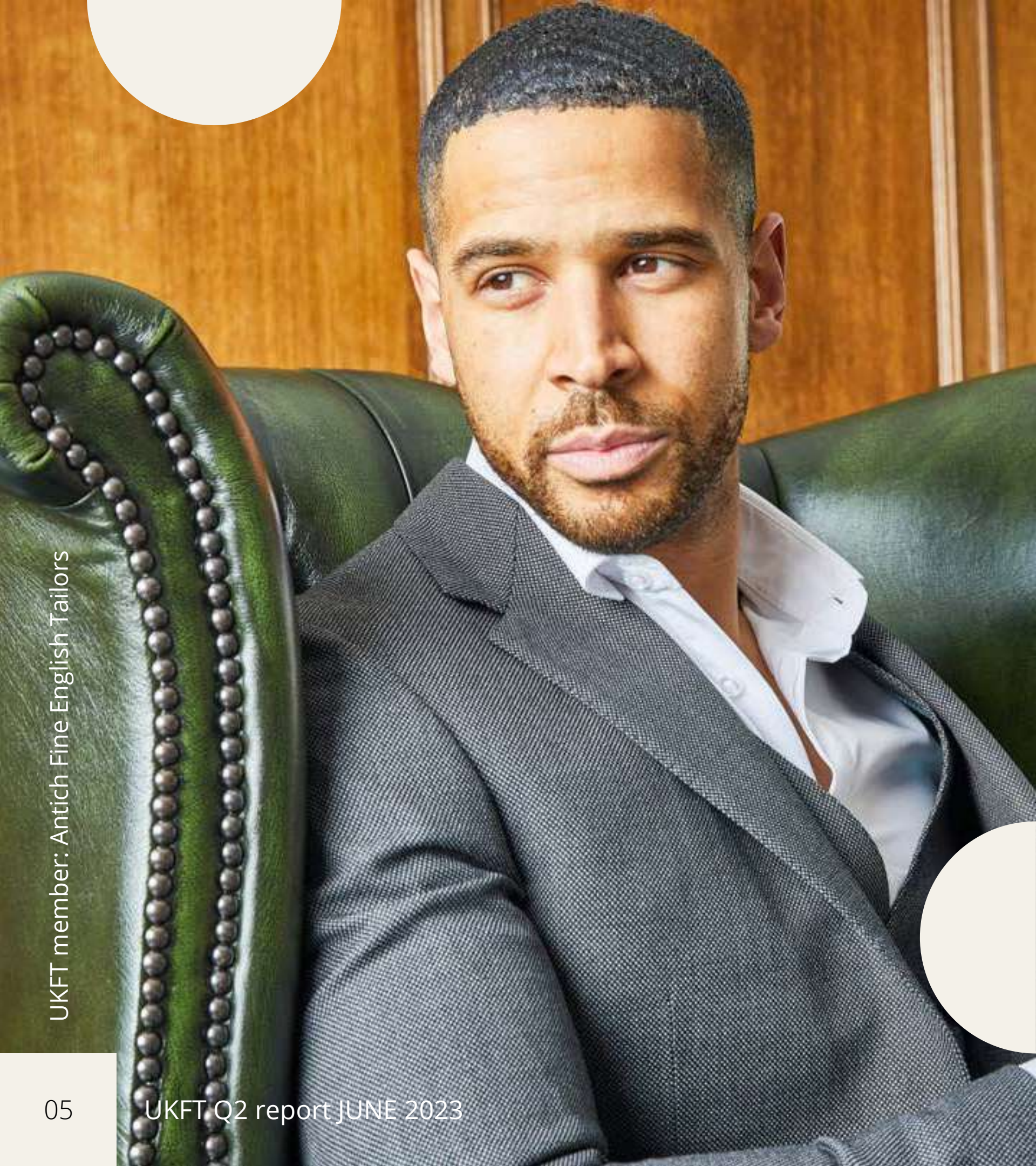
UKFT member: Antich Fine English Tailors