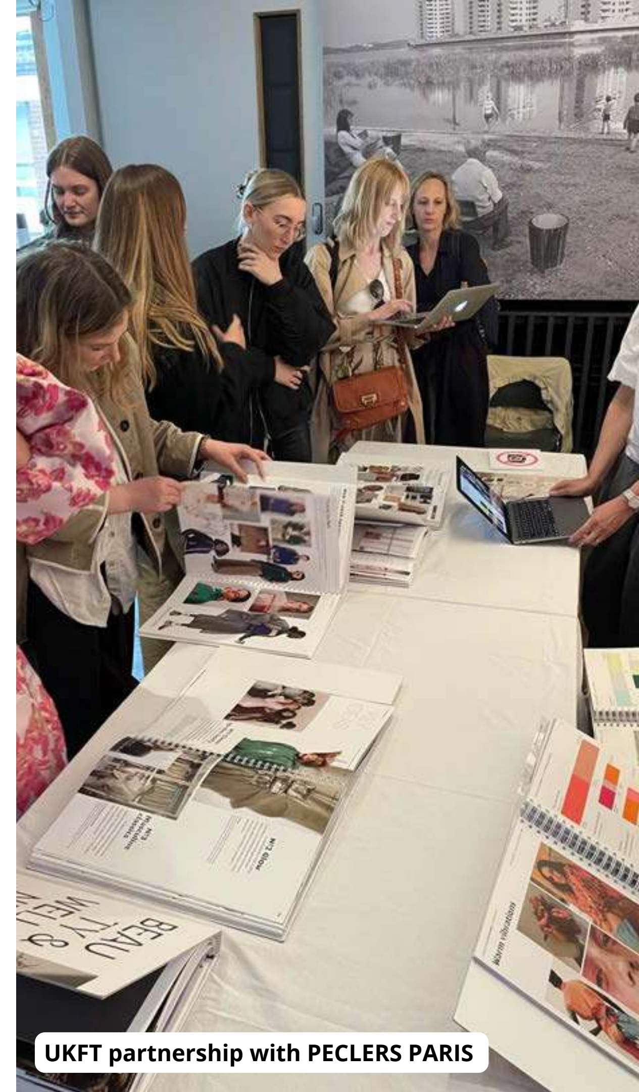
UKFT partnership with PECLERS PARIS

Peclers Paris also offers UKFT members exclusive access to trend presentations for colour inspiration.