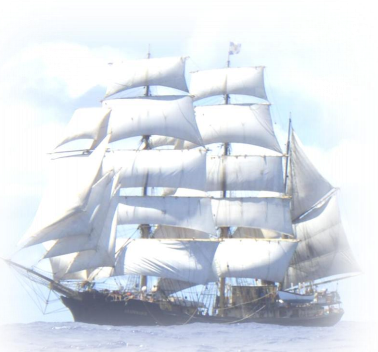
British Millerain sailcloth. Picton Castle Ship

British Sailors treated their flax canvas sailcloth with linseed oil, which prevented the sailcloth from becoming soaked, keeping it light and efficient in the strong winds. Left over pieces of oiled sailcloth were often crafted into crude smocks and worn by the men on deck to protect them from the harsh biting winds and sprays.