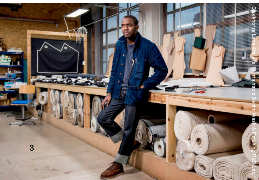
Blackhorse Lane Atelier's Sustainable Denim Wash & Finishing R&D Lab