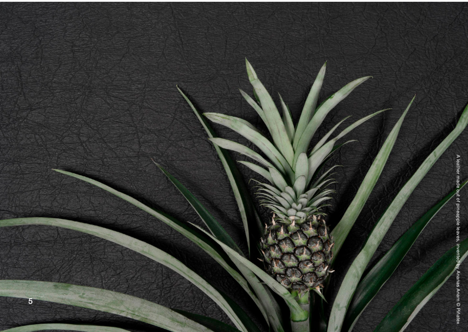
A leather made out of pineapple leaves, invented by Ananas Anam

Can technologies like virtual and augmented reality provide new reasons to visit local high-streets? Could innovations in virtual environments such as those in the gaming sector merge with design and creativity from the fashion world?