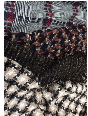
(Hall 5.1 - Premium Wool Zone)

Since 1912, Linton Tweeds has designed and manufactured creative fabrics for global luxury brands. Their collection for A/W 20/21 was inspired by the pre-Raphaelite era, with woodland, carnival and Scandinavian themes inspiring their design team to create an exciting new A/W collection. Linton's unique fabrics have really taken off in the Chinese market during the last 12 months. Their partnership with agent Shanghai Run Unison has been very successful and Chinese customers really appreciate Linton's rich history and innovative fabrics. www.lintondirect.co.uk